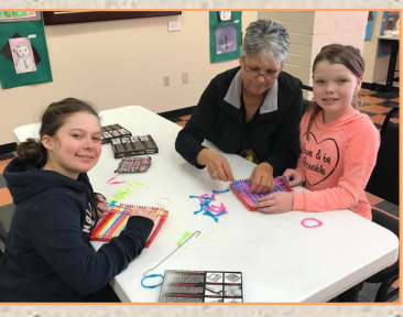
Making Potholders at Free Fun Hour!