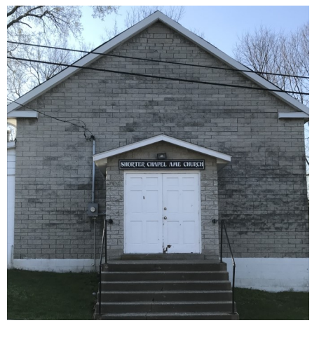
Shorter Chapel AME Church