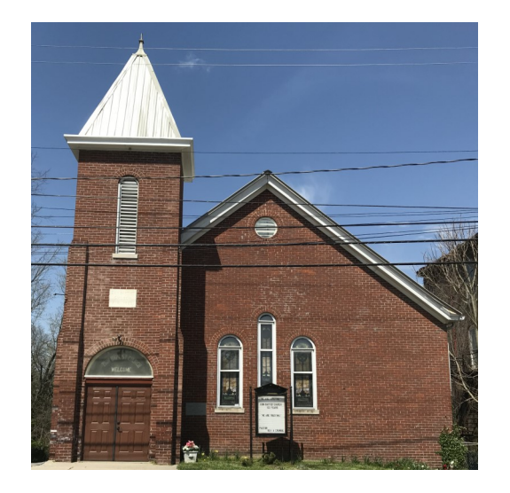
Zion Baptist Church