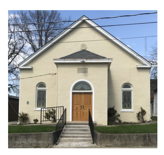
Seventh St. Christian Church