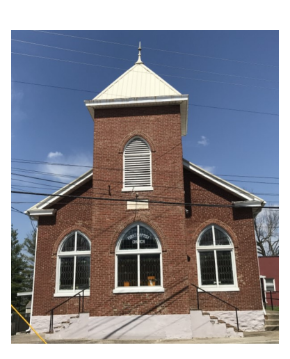
First Baptist Church, 8th St.