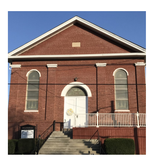
St. Paul's United Methodist Church