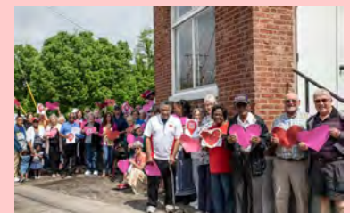
Above: First Baptist Church, 8th St.