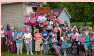
Above: Shorter Chapel AME Church

In May, we celebrated National Historic Preservation Month and HPBC's 40th Anniversary with a tour of historic African American churches in Downtown, Paris. Below are pictures where we "heart bombed" each church, in order show our love for these historic buildings with the community.