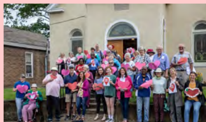
Above: Seventh Street Christian Church