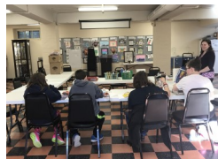
Exhibit Opening! February 10, 2-4 PM

Becoming American: The Immigrant Experience in Bourbon County, Kentucky