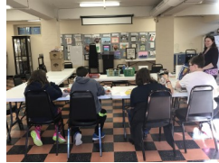
Exhibit Opening! February 9, 2-4 PM

Politics the Damnedest: Bourbon County People, Events, & Movements from 1780-1980